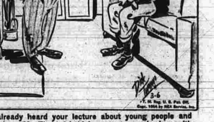
I already heard your lecture about young people and marriage... BY DICK TURNER