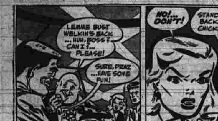
LEAVE BUST WILKIN'S BACK BY J. R. WILLIAMS