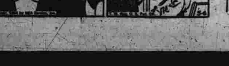
I'M A DREAMING ROOM BY V. T. HAMLIN