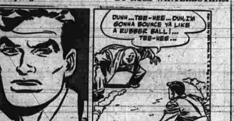
NO! NO! NO! BY V. T. HAMLIN