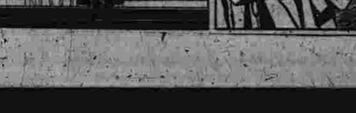
I'M A DREAMING ROOM BY DICK TURNER