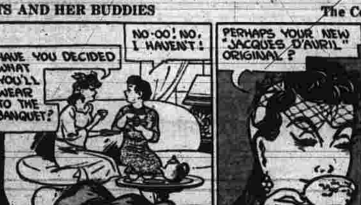
HAVE YOU DECIDED BY DICK TURNER