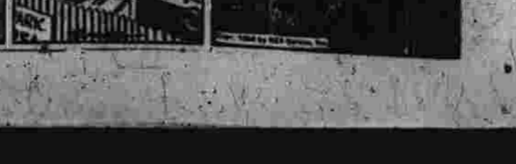
I'M A DREAMING ROOM BY DICK TURNER