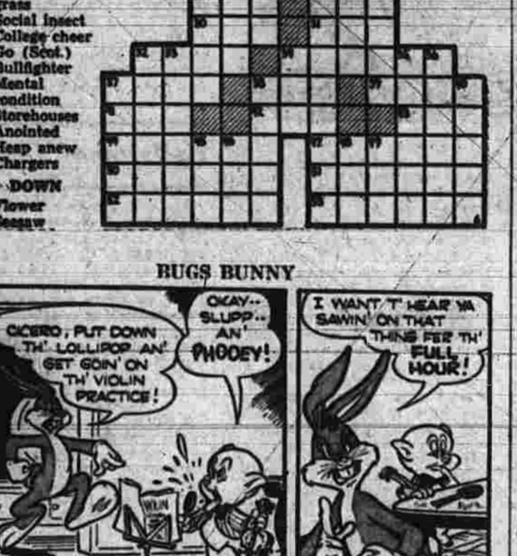
BUGS BUNNY BY DICK TURNER