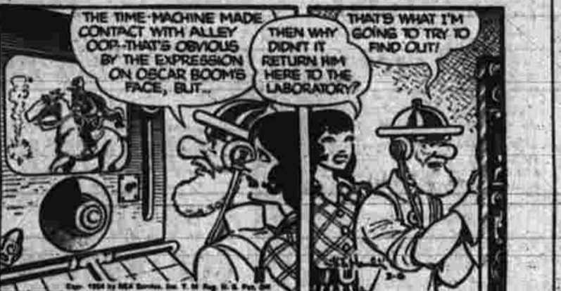
Good Luck, Doctor! BY V. T. HAMLIN